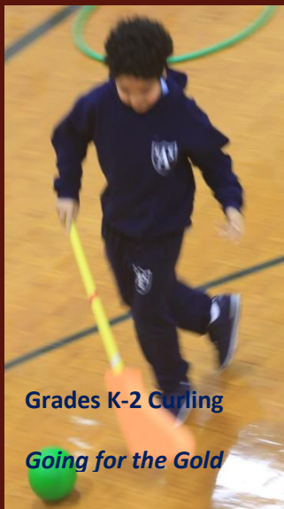
Grades K-2 Curling Going for the Gold