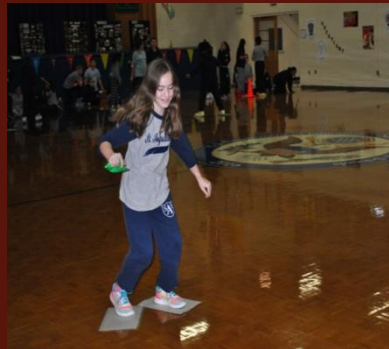
Grades 3-5 Bean Bag Biathlon Notice the indoor ski